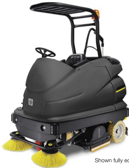
Shown fully equipped