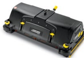
Brush heads R 75 / R 90

■ Included in delivery. Optional. 1) 330 Ah, low-maintenance. 2) 360 Ah, low-maintenance. 3) 312 Ah AGM low-maintenance.