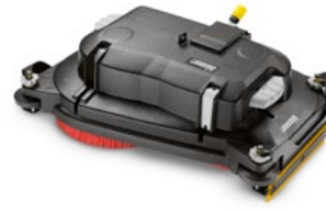
Brush heads D 75 / D 90