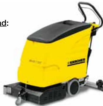
BR 530 Bp

Increases area performance before refilling.