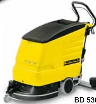
BD 530 Bp