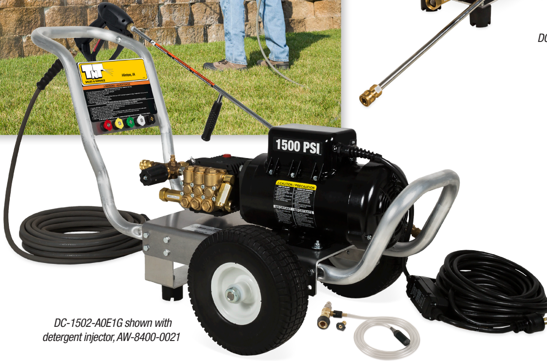
DC-1502-A0E1G shown with detergent injector, AW-8400-0021