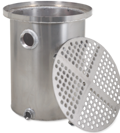
56-0069 & 56-0070