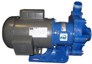
Magnetic drive pumps