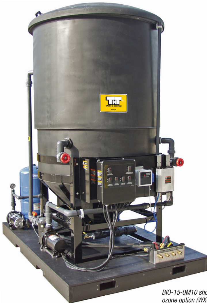
BIO-15-0M10 shown with ozone option (WX-0020)