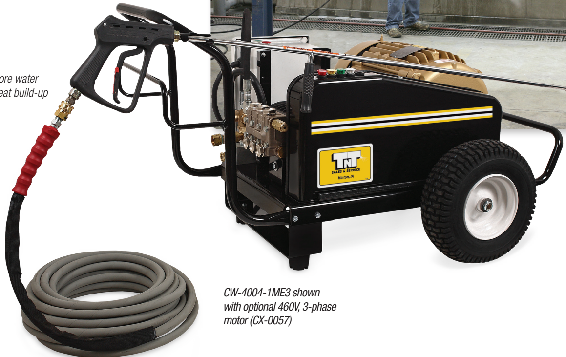
CW-4004-1ME3 shown with optional 460V, 3-phase motor (CX-0057)