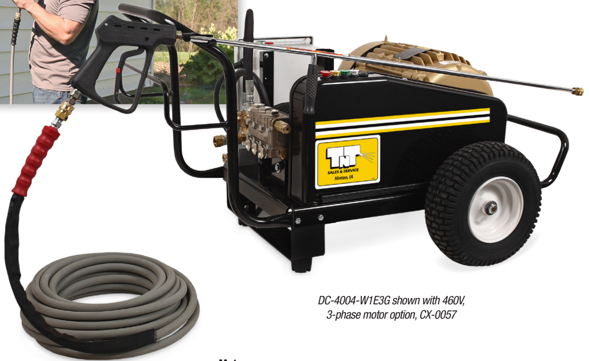
DC-4004-W1E3G shown with 460V, 3-phase motor option, CX-0057