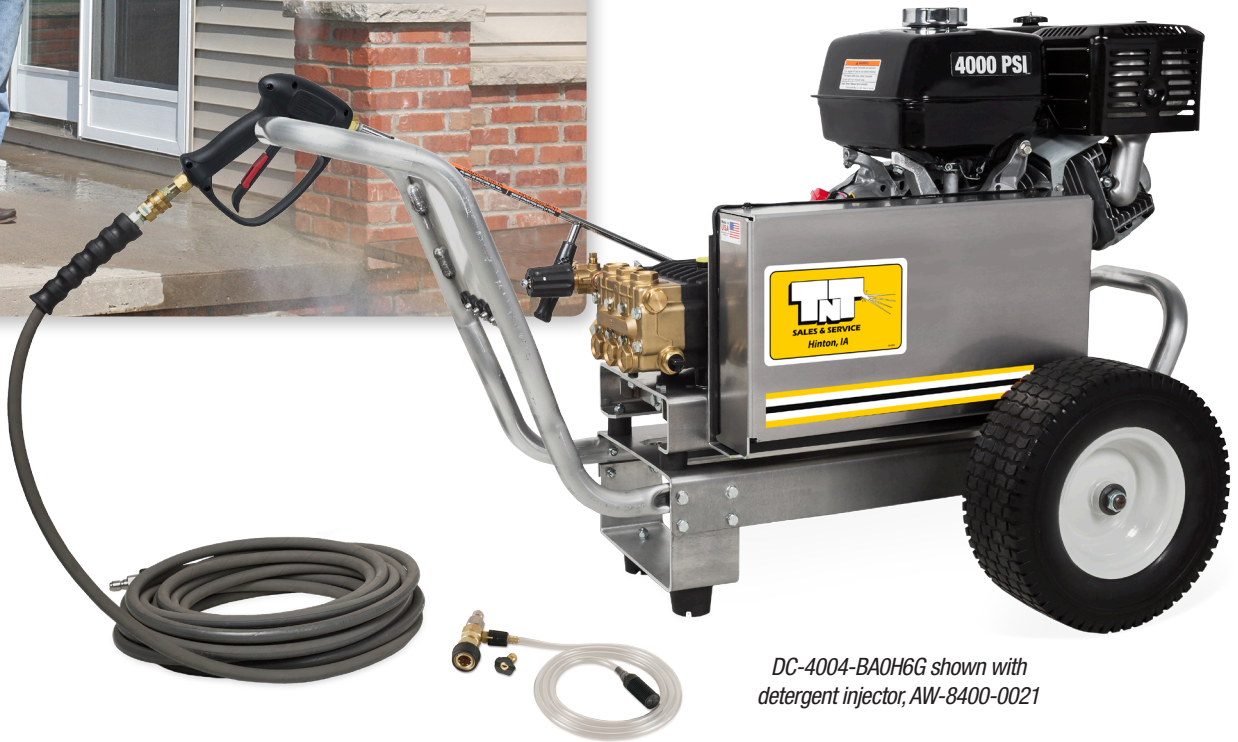
DC-4004-BA0H6G shown with detergent injector, AW-8400-0021