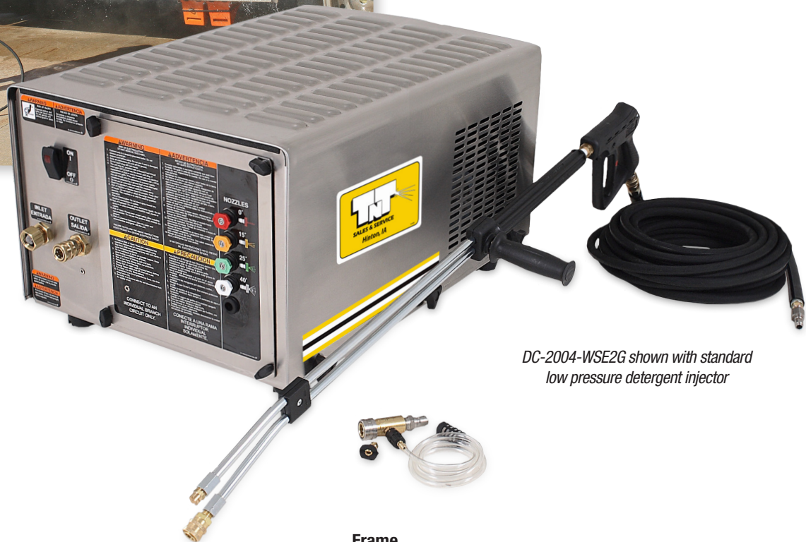
DC-2004-WSE2G shown with standard low pressure detergent injector