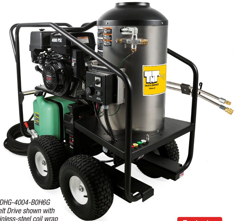
DHG-4004-BOH6G Belt Drive shown with stainless-steel coil wrap option, HX-0273