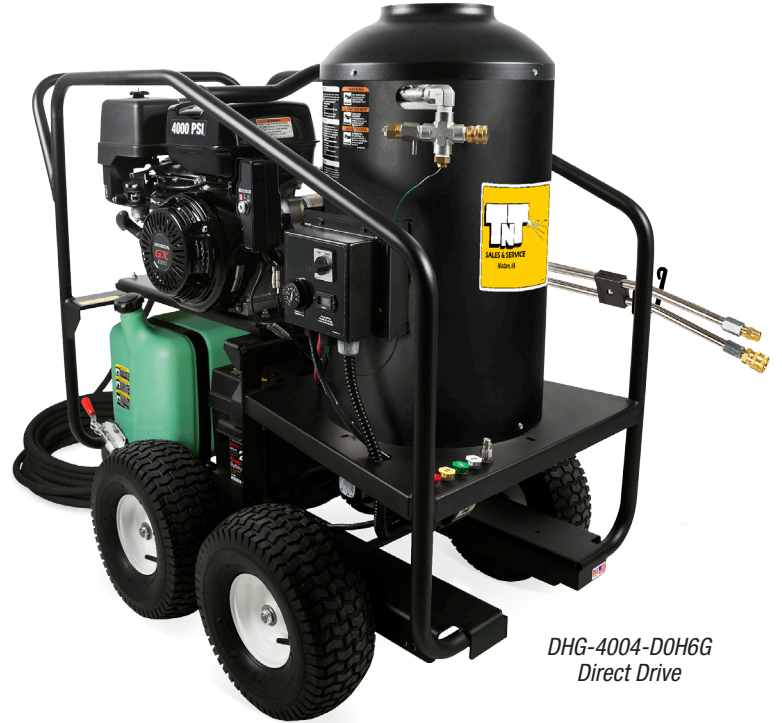
DHG-4004-DOH6G Direct Drive