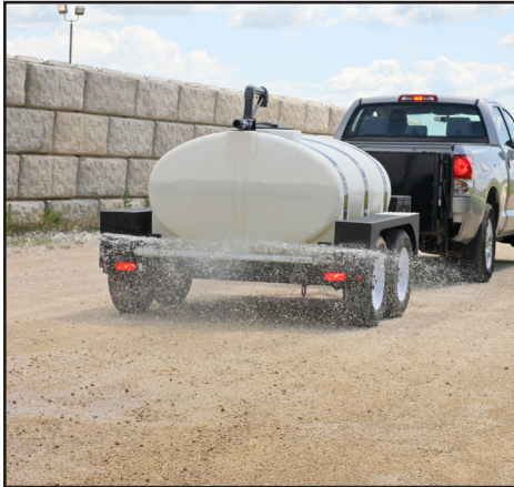
Shown with TX-0008, optional hard suction

Control dust on every jobsite with this dual-axle, 510-gallon water trailer. Offering rear spray, fire and garden hose hook-ups and hydrant fill capabilities, this tough and durable water trailer is perfect for cleaning parking lots, heavy equipment, streets, and a host of other applications. Pair with a 2-inch semi-trash pump and tackle any job requiring portable water.