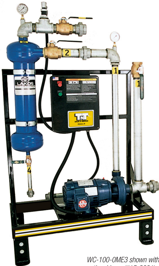
WC-100-OME3 shown with optional hose (#15-2001) and hose reel (#50-2001)